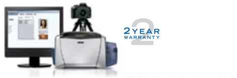
DTC400 printer/encoder shown with Fargo Asure ID software.