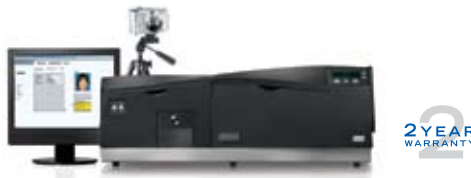
DTC550 printer/encoder shown with optional lamination module.